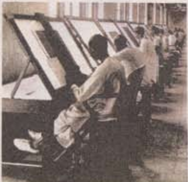
Duffing Section staff at work at the Survey of India, Calcutta, 1890s-1911

Admittedly, older maps are visually appealing, but modern maps have a great deal of accurate and current information embedded in them. Illustrations on old maps did not always make them more reliable. Adding graphics was often the means to distract from obvious lack of information. I believe very attractive maps are still produced, but the content and motifs have changed over the years.